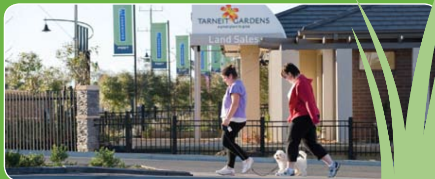
The pedestrian and cycling pathways at Tarneit Gardens are ideal for getting active.