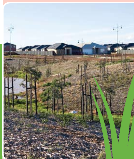
Planting works last year have paid dividends this Summer.

The Department of Transport has more information at www.metlinkmelbourne.com.au .