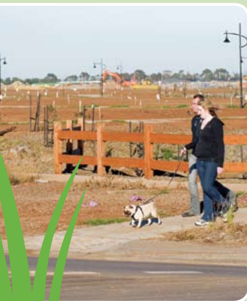
New homesites recently completed at Tarneit Gardens.

As more and more information is released about local transport enhancements and new services in the area, there's no doubt residents will be moving into an established community that continues to grow and thrive.